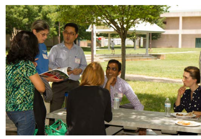
Attendees enjoy lunch in the courtyard during Symposium.