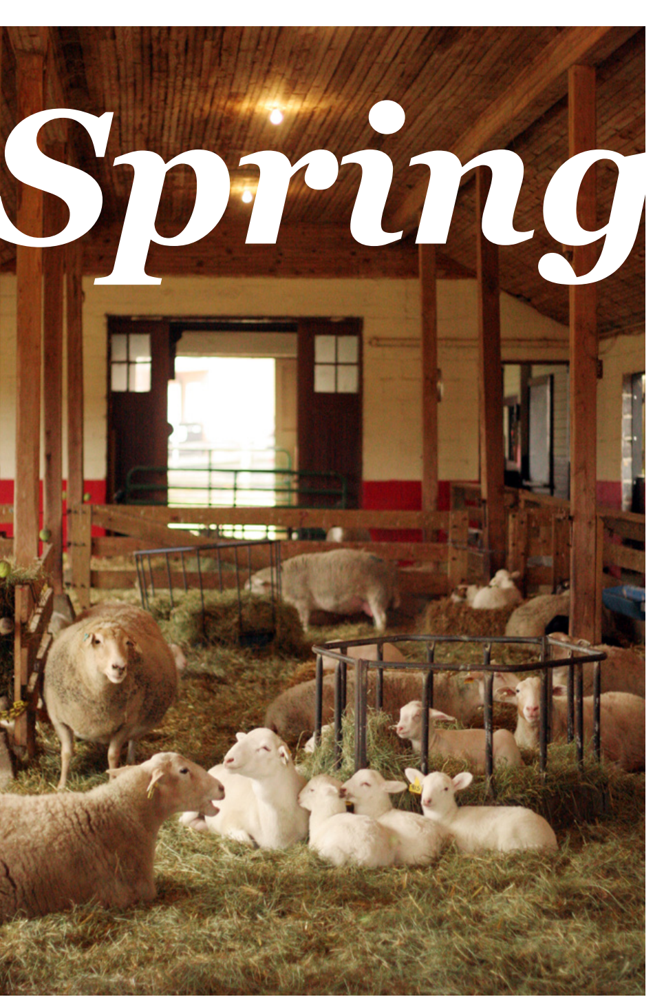
Spring has arrived on the Campus Farm! Lamb Watch, ANSC235 is in full swing... read more